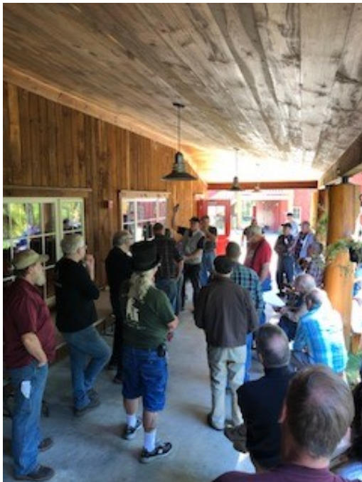
Our Iron-in-the-Hat always draws a crowd.